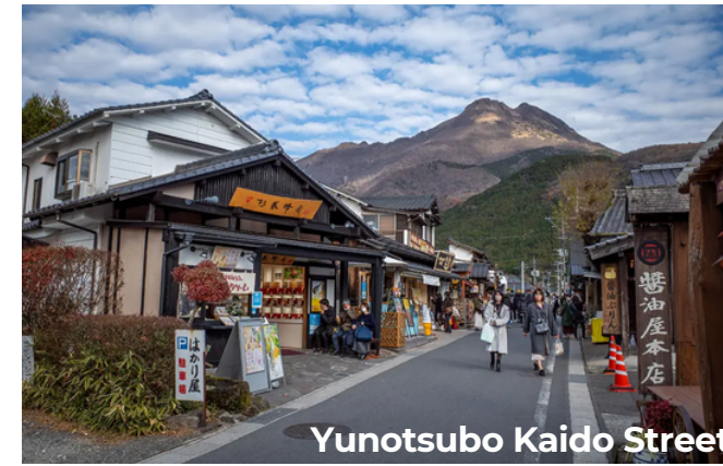
Yunotsubo Kaido Street

Breakfast Transfer to the airport for your flight back to Singapore. We hope you have had an enjoyable holiday with Deks Air!