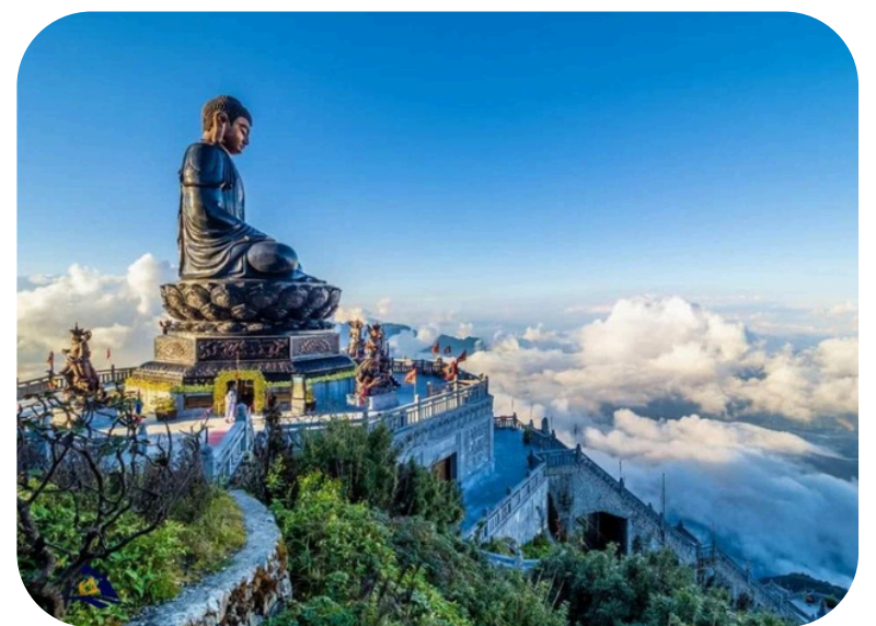
Mt Fansipan Sapa

Discover New Cultures | Explore Breathtaking Landscapes | Indulge in Exquisite Cuisine | Create Unforgettable Memories.